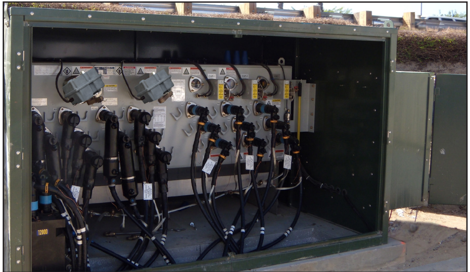
Motor operators installed on a G&W automatic transfer switch.