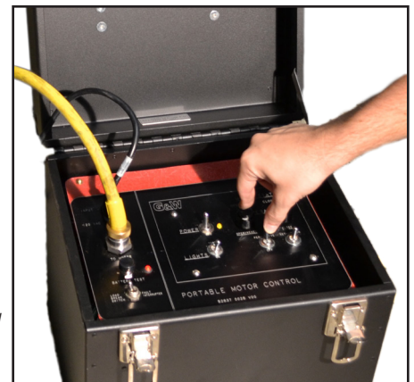
Portable Motor Control